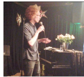
Sporadically I partake in comedy open-mic nights.

A team of young designers invited to address some important questions concerning the re-emergence of the synagogue on Gėlių street into the life of 21st-century Vilnius.